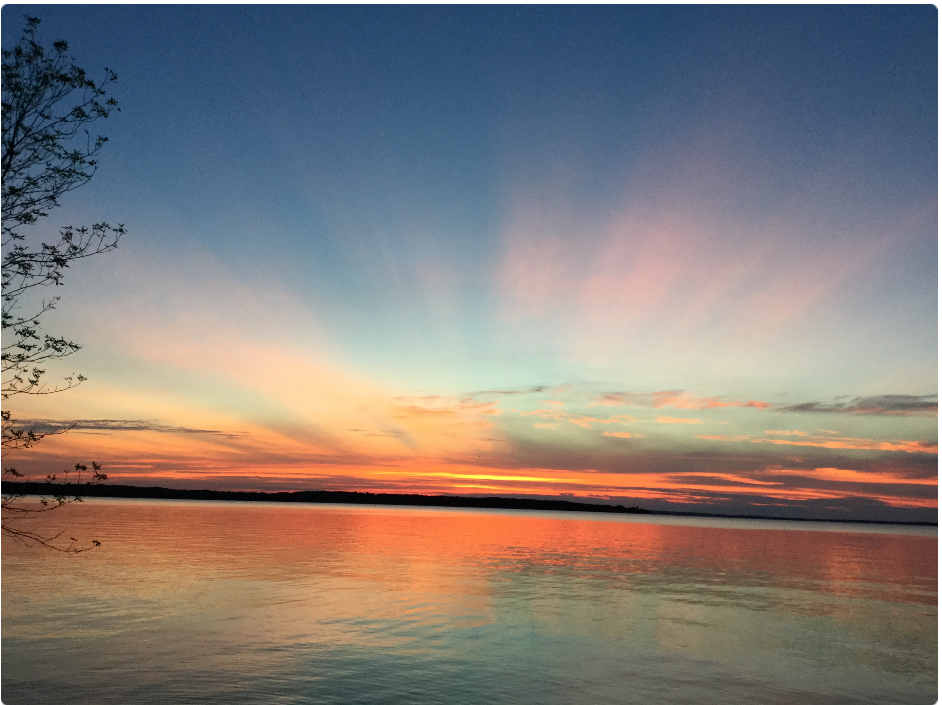
Sunset over Sturgeon Bay, Waubaushene 2020