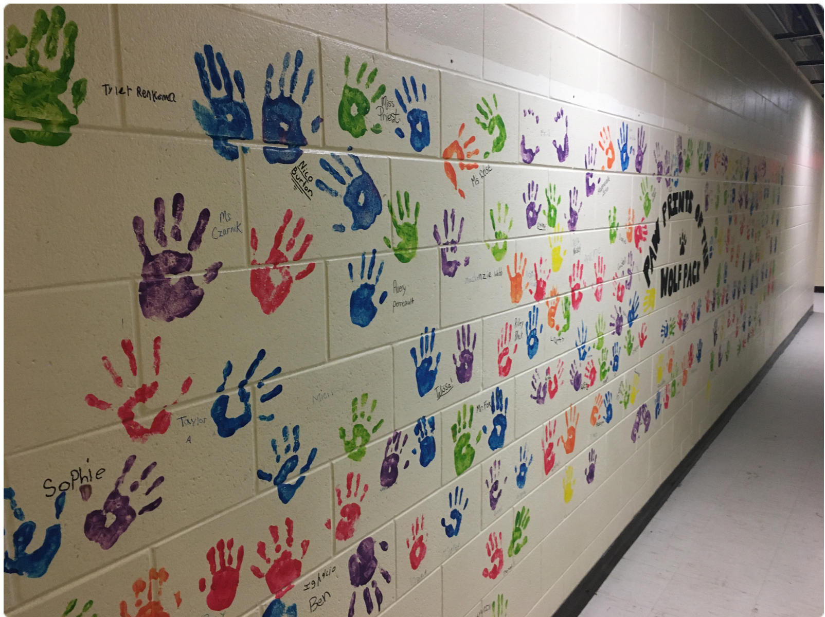
The "Wall of Handprints" at the Hazel Street Public School, Waubaushene

On a final note, we at Talpines are huge supporters of the new Community Hub Committee and their quest for a Community Hub in Waubaushene. We believe that a community hub building, whether new or restored, will be very popular, well used, and is badly needed in Waubaushene. We believe it should be a high priority.